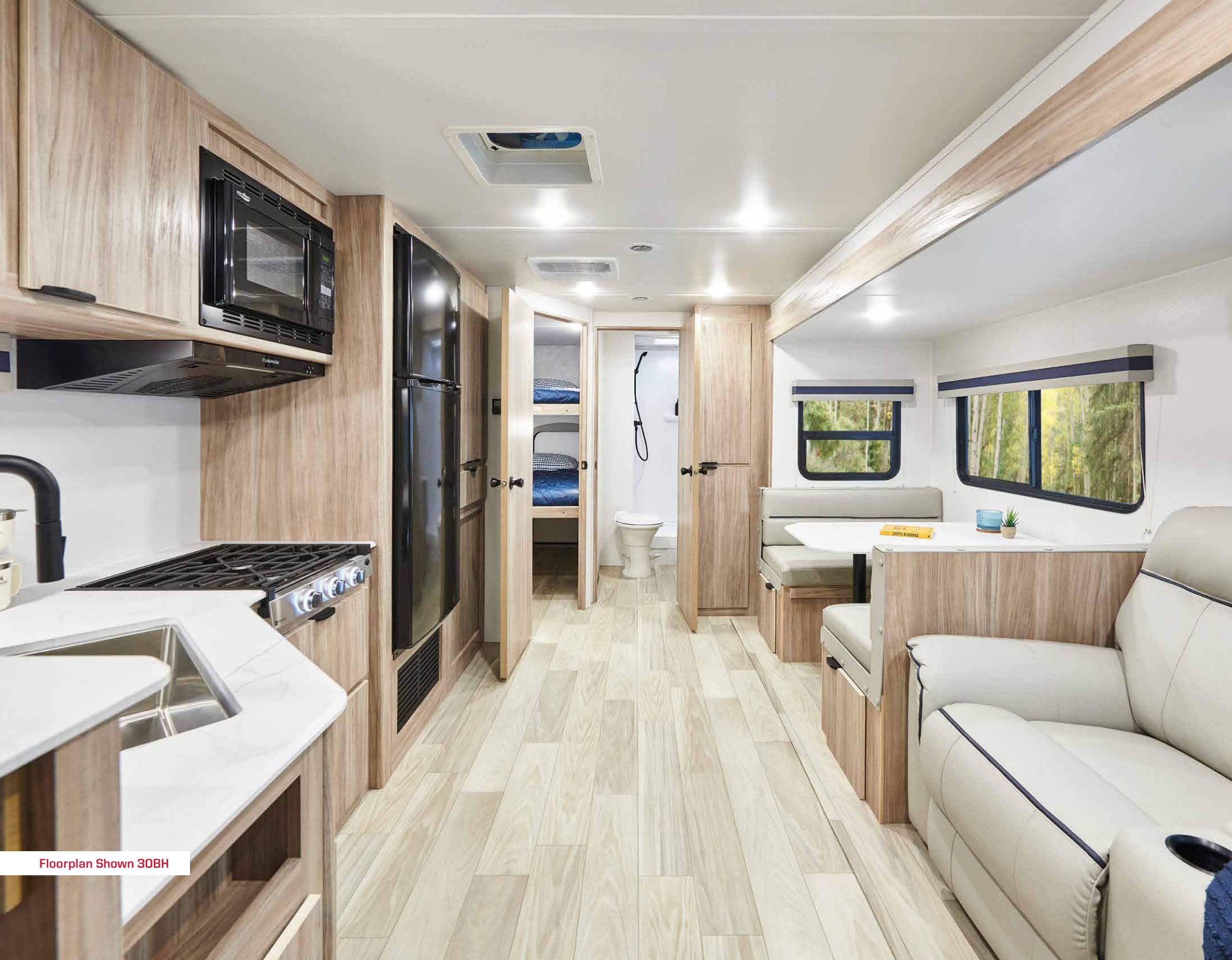
Floorplan Shown 30BH

The Winnebago Access offers five distinct floorplan options, allowing you to choose the layout that suits your needs, including options for a bunkroom (26BH, 30BH). Whether traveling with family or friends, the Access ensures everyone has a comfortable place to rest, along with intelligently designed underbed storage to maximize your space.