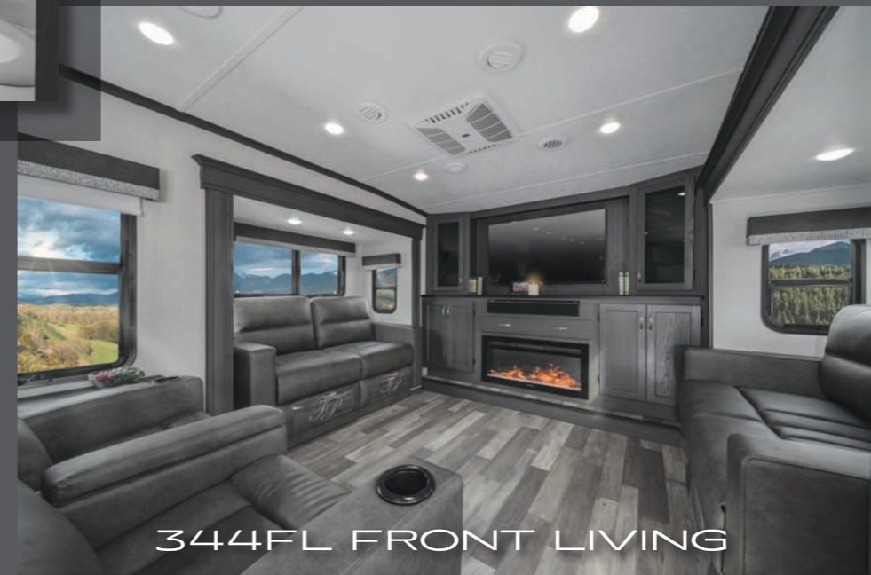
344FL FRONT LIVING