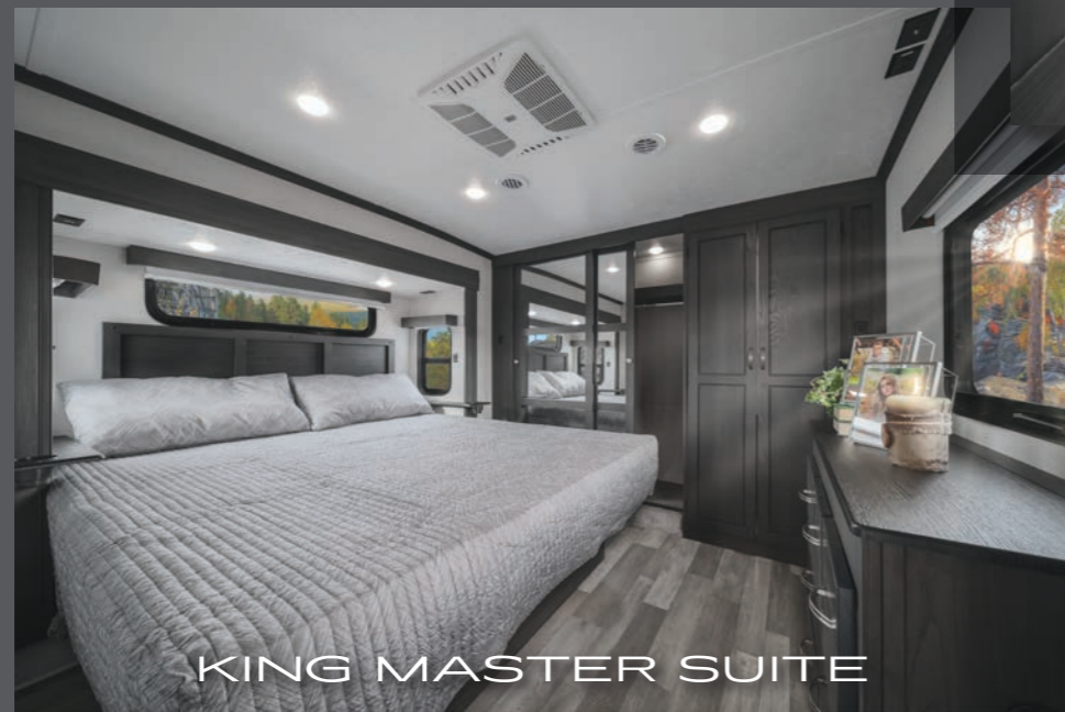
KING MASTER SUITE