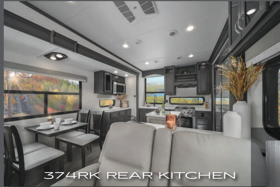
374RK REAR KITCHEN