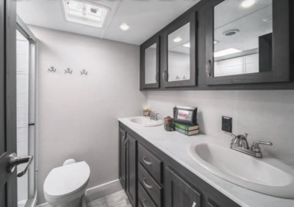
EXTRA LARGE SHOWER WITH SEAT